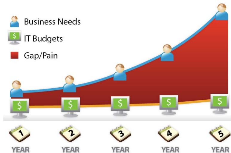
The Data Management Dilemma Figure 1

Relational database management systems are collectively the workhorse technology behind business software applications. It's therefore no surprise that industry analysts at Forrester Research pegged the global database market at $19 billion in 2008, with a compound annual growth rate of over 9%. Demand for enterprise-class data management solutions is enormous and growing rapidly, fueled by ongoing operational systems and the new internet-based applications discussed above. However, database vendor lock-in poses a formidable obstacle to business growth.